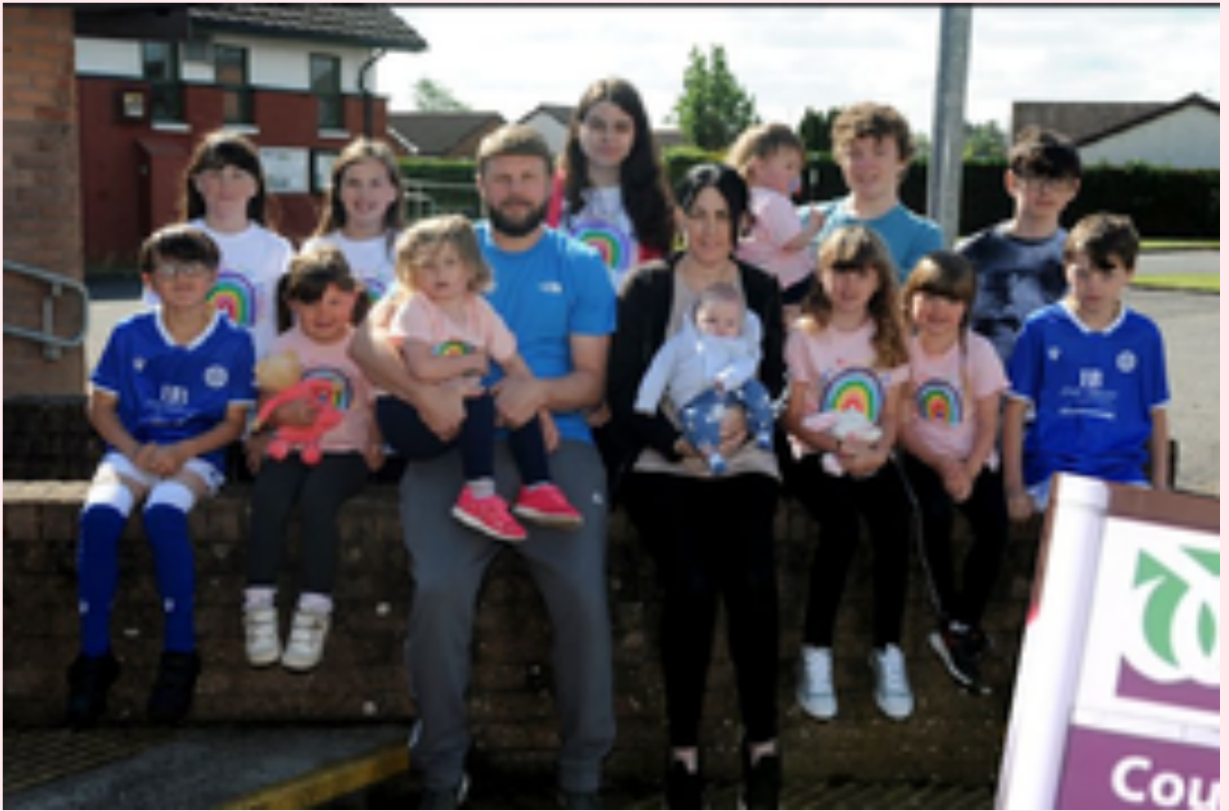
➤ Scots family of 15 facing homelessness if big enough house doesn't become available