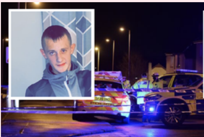
➤ Tributes pour in for Wishaw teens who died in horror motorbike smash as heartbroken family and friends mourn loss