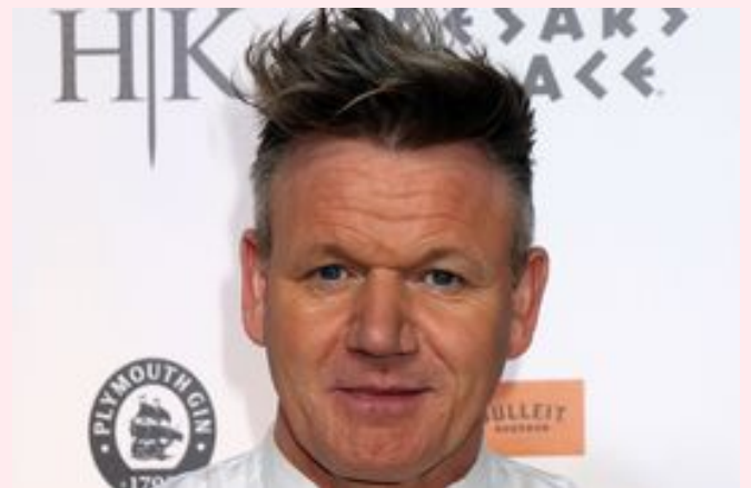
➤ Scots town branded 's***hole' by Gordon Ramsay as angry locals hit back at TV chef